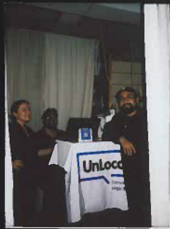
VOICES OF REAL NEW YORKERS