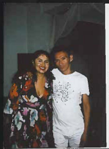
VOICES OF REAL NEW YORKERS