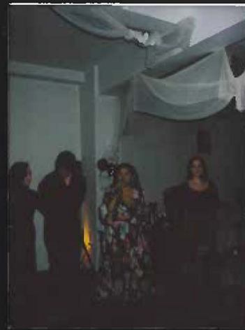
VOICES OF REAL NEW YORKERS