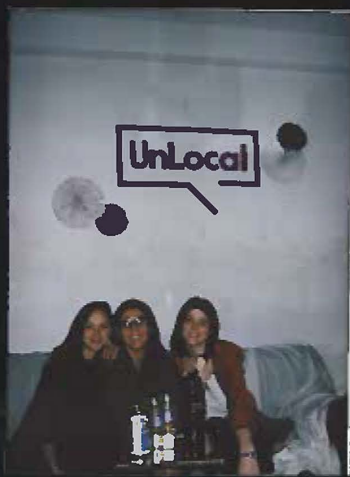
VOICES OF REAL NEW YORKERS