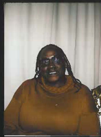
VOICES OF REAL NEW YORKERS