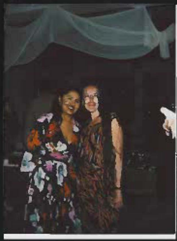
VOICES OF REAL NEW YORKERS