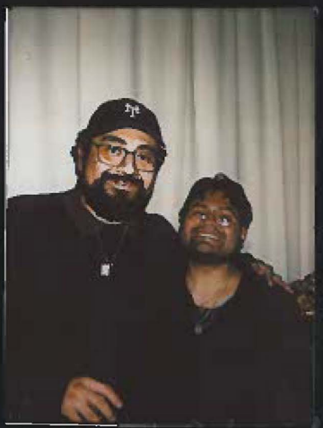
VOICES OF REAL NEW YORKERS