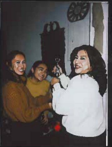
VOICES OF REAL NEW YORKERS