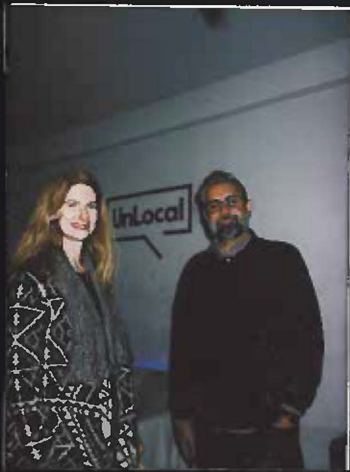
VOICES OF REAL NEW YORKERS