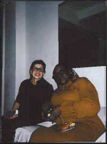
VOICES OF REAL NEW YORKERS